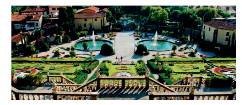
Day 7 Thursday June 27, 2019

We arrive at Civitavecchia this morning and travel to the beautiful Gardens of Ninfa (Giardin di Ninfa), located in the Lazio region of Italy, about 40 miles south-east of Rome. Ninfa was a substantial town going back to the times of the Romans. Having fallen into decay over centuries the ruins were transformed into a botanical garden. Now plants wind over ruined towers and walls, rejoicing in the lush damp conditions. The setting is indescribably atmospheric, with roses scrambling for footholds in ruined archways, and the frescoed church wall still standing open to the weather. Roses, banana trees, maples and resident ducks thrive in the microclimate of Ninfa. The dampness of the location, under the hills facing the coastal plain, leads to an unusual mixture of species.