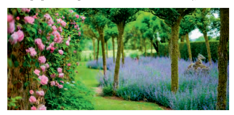
Day 19 Tuesday July 9, 2019

Today we travel to visit the Garden House. The garden was originally developed in the 1940's, centred around the ruins of a medieval village. The three derelict terraces were developed with a diverse range of plants including rhododendrons and mahonias. There has recently been a program of re-planting in the walled garden and long walk, which have resulted in a stunning high standard garden. We continue to the historic city, Taunton.